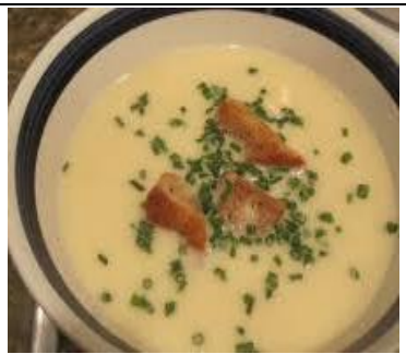
Cream of Mushroom Soup Blended Split Pea Soup