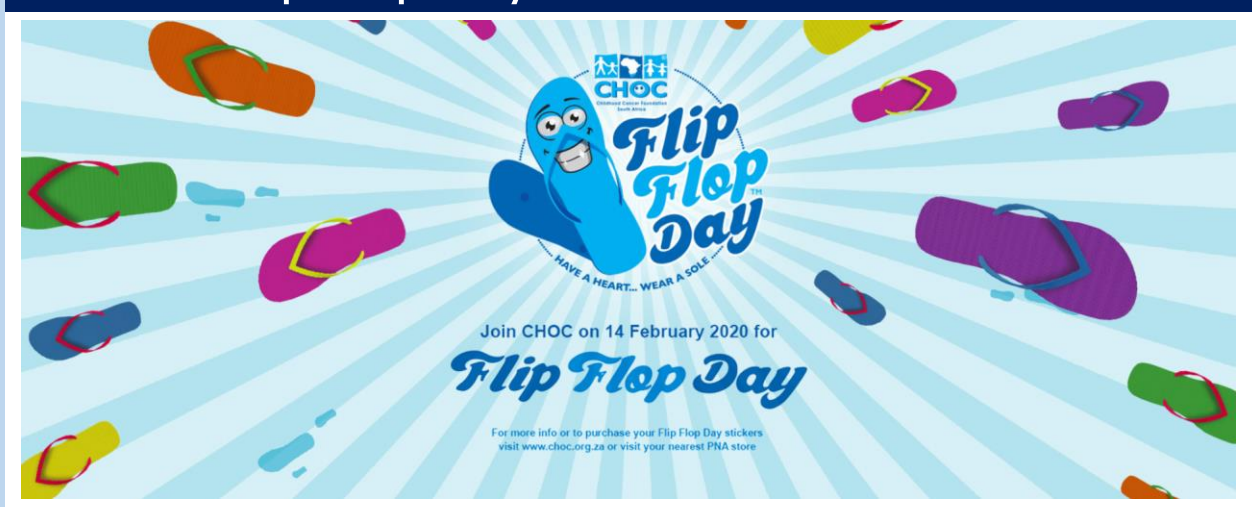
Click the picture to watch a 30 second promotional video1.

Schools who are interested are invited to treat the Flip Flop Day as a casual day and allow learners who bought stickers to wear flip flops to school on Flip Flop Day, Friday 14 February 2020.