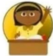
Respek - Respect