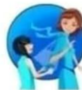
Eerlikheid - Honesty