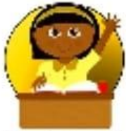
Respek - Respect