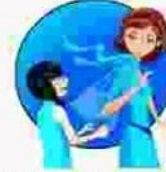
Eerlikheid - Honesty