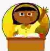
Respek - Respect