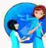
Eerlikheid - Honesty