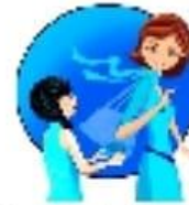
Beroutheid - Honesty