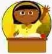
Respek - Respect