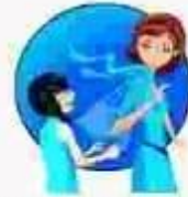
Eerlikheid - Honesty