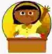
Respek - Respect