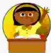
Respek - Respect