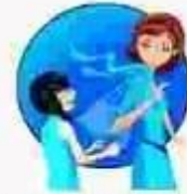
Eerlikheid - Honesty