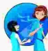
Eerlikheid - Honesty