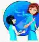
Eerlikheid - Honesty