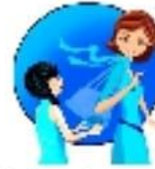
Vertelheid - Honesty