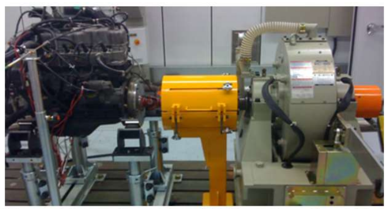
Eddy current dynamometers use a magnetic field to provide counter restraining torque that increases with shaft speed.